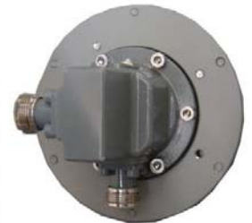
Dual Polarized Feed