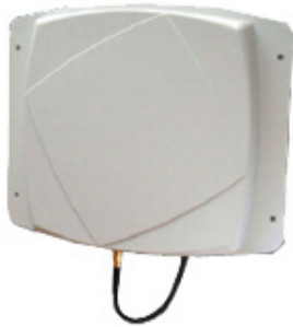
OA-900RM RFID Reader Antenna