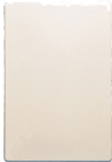
OA-900RP Flat Panel Reader Antenna